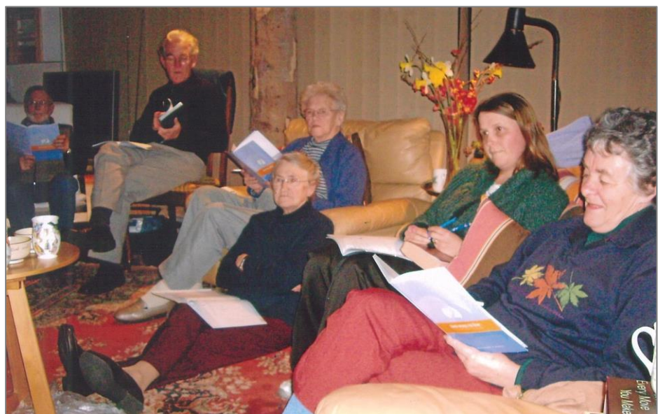
Home Group studying "Two ways to live"

Because, firstly, there is one God, the Creator and Redeemer of all people, and all people therefore owe him their loyalty, love and lives - to his glory and praise (Ps 96; Acts 17:16-31); secondly, because in the resurrection and glorification of Jesus, God invested all authority in his Son, who now embodies the reign of God over the seen and unseen world - Jesus is Lord (Rom 10:8-12; Acts 17:30-31; Phil 2:5-11); thirdly, because those who persist with their God-substitutes (= themselves, their families, their work, their obsessions,